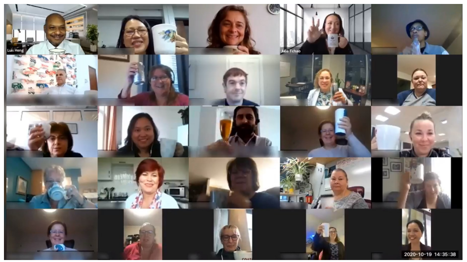
Screenshot of the live "happy anniversary" video session

The celebration of Consepsys's 10th anniversary was something to remember!